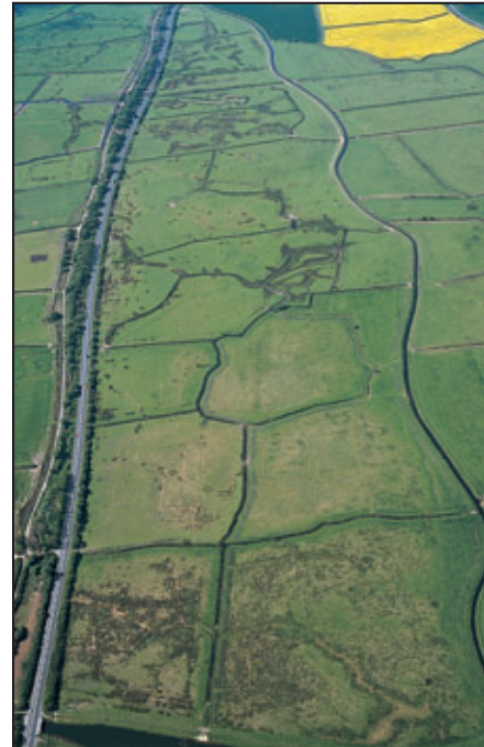
Fields are drained by an irregular network of minor dykes and the area is crossed by long straight raised roads linking settlements.

Electricity transmission lines and pylons form dominant vertical features in the flat and open landscape.