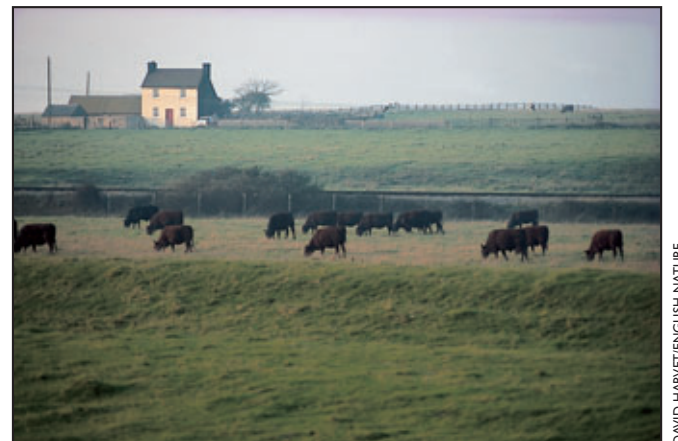
Farm buildings and settlements traditionally of brick and flint construction, are situated on pockets of raised land.

Extensive floods and inundation by the sea in the late Middle Ages led to the abandonment of much of the Pevensey Levels. As the continued inning of the wetland reduced the tidal flow the outfall of the Levels became blocked resulting in widespread flooding as the discharge of land drainage into the sea was prevented. Early sea defence works, of the 13th century., using brushwood and wooden stakes, were followed by the 14th century Crooked Ditch. Further wooden sea defences constructed in the early 16th century were followed by concrete sea walls, first in the early 19th century and then again in the mid-20th century.