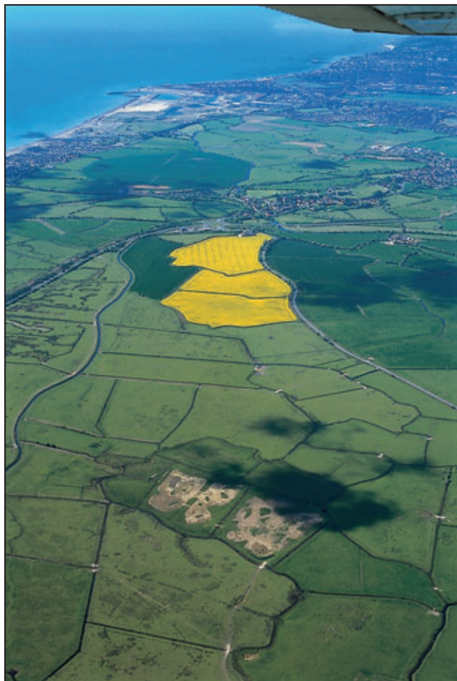
The Pevensey Levels have remained primarily as grazed pasture, arable areas being confined to a few drier locations.

Much of Pevensey Levels, in contrast to Romney Marshes further along the coast in Kent, is still predominantly open cattle-grazed wet pasture. Although the Levels have been subject to extensive drainage and improvement for agricultural use relatively little has been subject to arable conversion. The often old drains that divide the fields are typically reed-filled, their channels forming barriers to grazing stock movement within the levels. Apart from along roadways, fences and hedgerows are infrequent features.