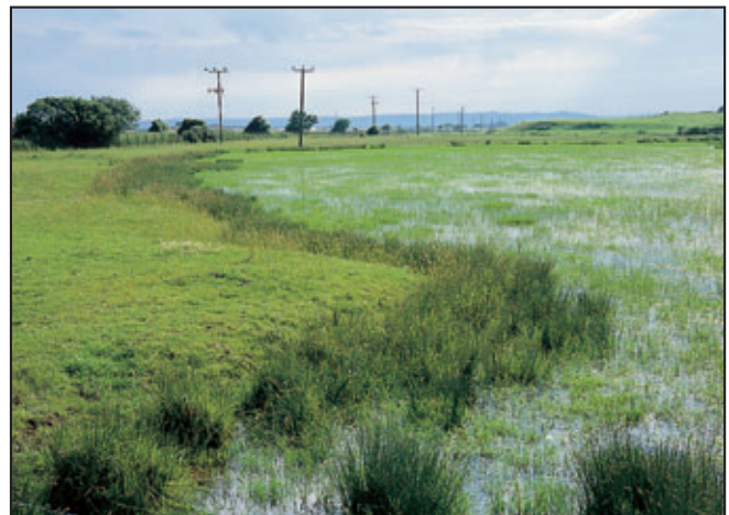
Power lines and isolated trees are prominent features of the extensive areas of flat rushy pasture and standing water.

The Crooked Ditch, a 14th century sea defence and its embankment, follows the ancient irregular pattern of the individual fields. A chequerboard pattern of ditched fields in the landscape has remained virtually unchanged. The upper course of the ancient Mark Dyke, although no longer a major drain, is still visible today as a reed-filled, silted channel. Pevensy Castle overlooks the Levels near the coast, further adding to the historic interest of the area.