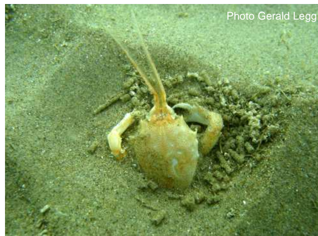
Masked Crab, Corystes cassivelaunus ; Seaford Bay.