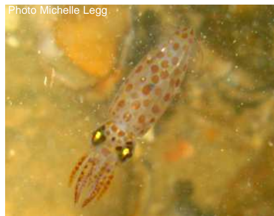
Juvenile Squid, Alloteuthis subulata ; At night Seaford Bay.