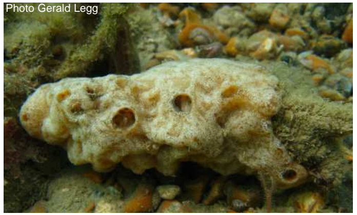
Sponge, ? Myxilla encrustans on cobble of Rottingdean Beach