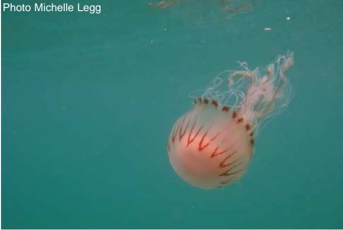
Compass Jellyfish, Chrysaora hyoscella of Shoreham